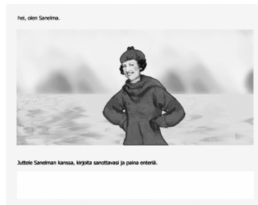
Figure 8: Sanelma chatbot

woman from Helsinki of the 30's as shown in figure 8.