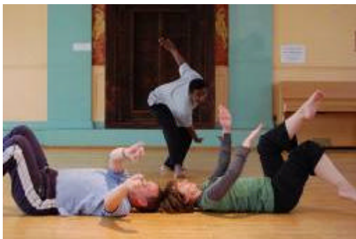
Re-embodiment exercise

and the primary objectification constituted by the capta . This can be regarded as a space of performance, or in performance theorist Schechner's terms 'restored behaviour'. Performance is 'twice behaved behaviour' in that the original behaviour is always absent. (Schechner 1991, p.206) Performance skills assist us in soliciting kinaesthetic re-embodiment by the respondent of the fugitive phenomenal experience, to enhance the quality of the capta . Thus the March 2008 retrospective evaluation was conducted as a re-embodiment. The ST associates recalled their experience kinaesthetically, by viewing video footage. ST and research team embodied the robot for their interaction, in a reprise of the 'distributed robot' process described above. Evaluation moved seamlessly into fresh embodied prototyping of the object as originally conceived and also in divergent iteration as an interactive room with robotic elements. Re-embodiment here offers an 'imaginative variation' (Moustakas, 1994: 98) through which participant experience can be processed towards identifying key themes and meanings of the experience whilst also generating fresh avenues for development. SpiderCrab is an 'objectile', a continuous variation of matter and development of form: the object becomes an event, always in the process of becoming through interaction (Deleuze 1993).