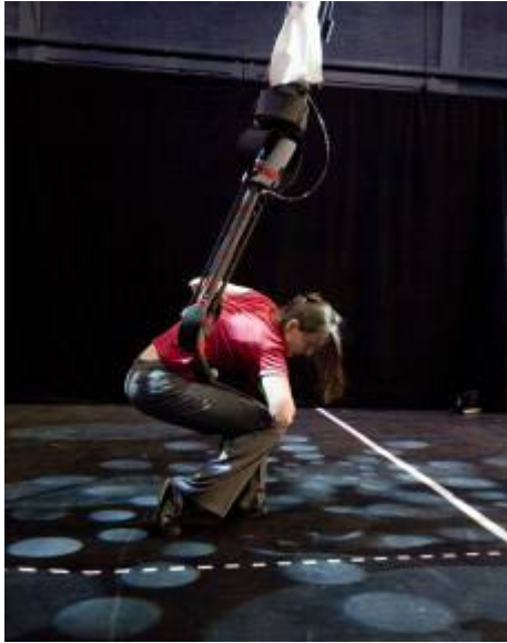
Isabel Jones and SpiderCrab