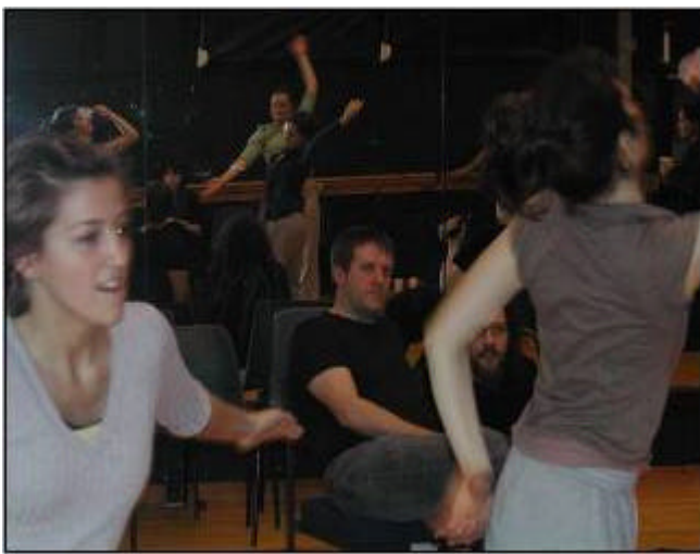
Dancers embody the robot observed by software designer and engineer

Kinaesthetic empathy created a third entity; the dancer-as-robot.