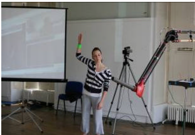
SpiderCrab prototype limb and dancer with armband

In the current iteration, human interaction with SpiderCrab is detected, via a green armband, by a vision system which forms the basis on which the robot's movements are generated using 'an interlingua for dance' (Wallis et al , 2007; Bryden & Hogg, 2008). This utilises Laban Movement Analysis (Hodgson & Preston Dunlop, 1990), a method of analysing and notating contemporary dance which focuses on the quality of movement