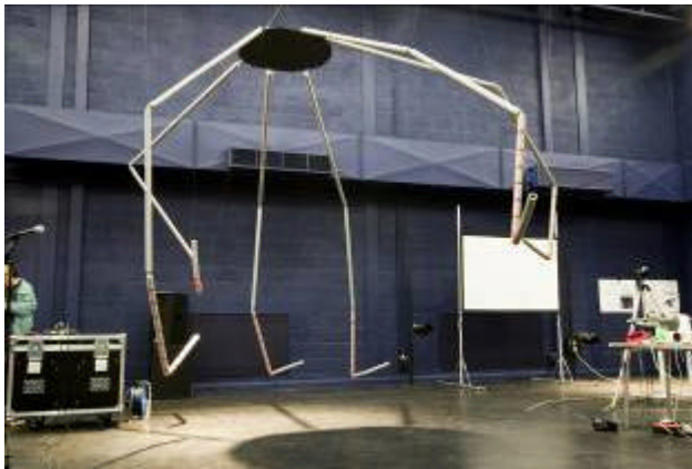
Maquette to convey eventual scale of SpiderCrab

environment and dancing partner, for deployment both on stages and in participatory arts contexts. Thus far, one limb has been constructed, and the whole robot realised in computer simulation. SpiderCrab 's physical design depends crucially on Shadow's patent air muscles, which are simple, light, soft, flexible and easily controllable – rendering smooth, natural yet powerful movement together with self-dampening and cushioning. Each limb comprises four segments with relative proportions corresponding to the Fibonacci series, linked by joints combining radial and lateral movement.